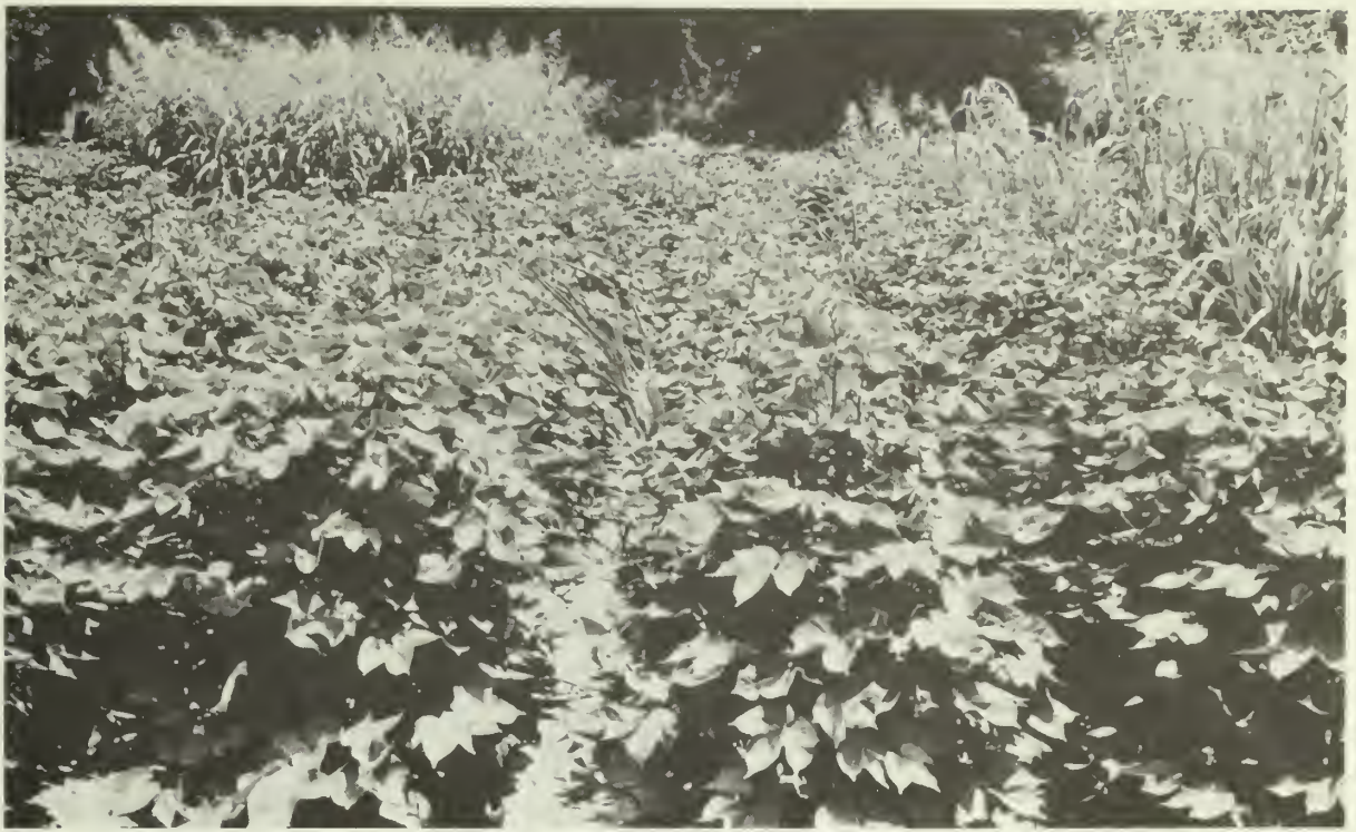
Figure 3. Example of johnsongrass control attained with one application of Fusilade, Verdict or Assure.