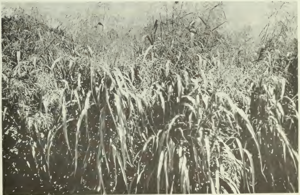
Figure 4. Johnsongrass populations in a plot treated with the Treflan standard.