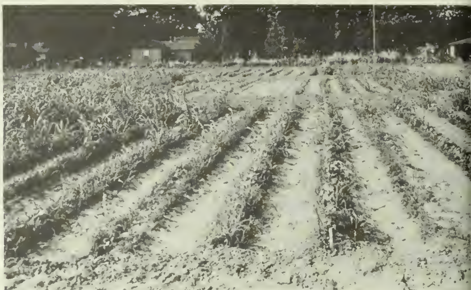
Figure 2. Degrees of initial burndown with the POE herbicides.

All treatments resulted in significantly higher yields than from the untreated control and the Treflan standard, which will not control rhizome johnsongrass in cotton effectively. Consequently, johnsongrass populations in the Treflan plot (Figure 4) were so dense that lint yield was very low in 1981, and mechanical harvesting was not possible in 1982.