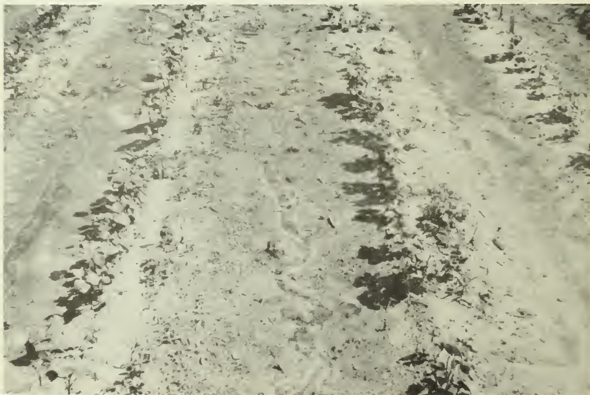
1 lb/A profluralin plus 1.5 lb/A fluometuron tank mix, preplant incorporated (photographed 33 days after treatment).