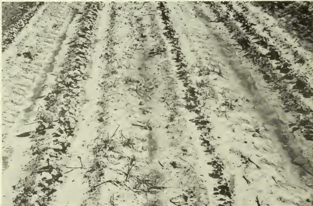
1.5 lb/A norflurazon (left) and 1.5 lb/A fluometuron (right), both applied preemergence (photographed 33 days after treatment).

2 Values within years followed by a common letter are not different (P = .05) according to Duncan's New Multiple Range Test.