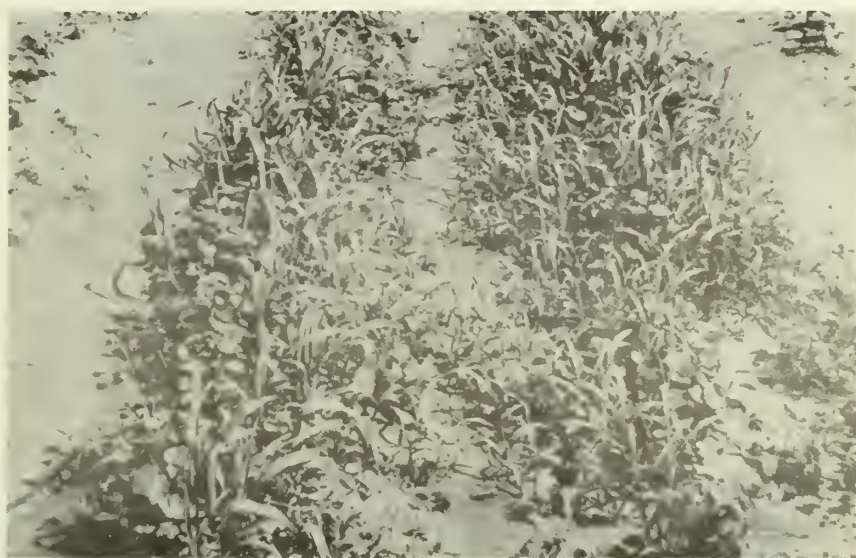
No herbicide (photographed 33 days after planting).

All plots were fertilized at the rate recommended for optimum production and seedbeds were prepared. We applied individual herbicides and tank mix combinations immediately after