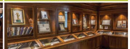
THE JOHN GRISHAM ROOM