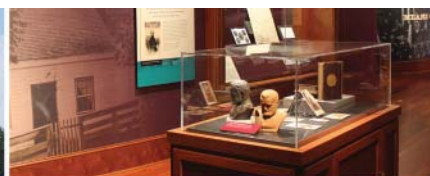
ULYSSES S. GRANT PRESIDENTIAL LIBRARY