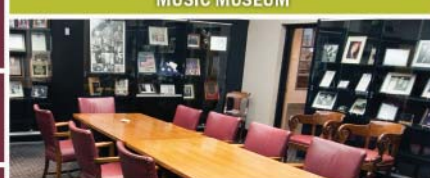
THE STENNIS-MONTGOMERY ROOM