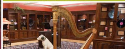
CHARLES H. TEMPLETON MUSIC MUSEUM