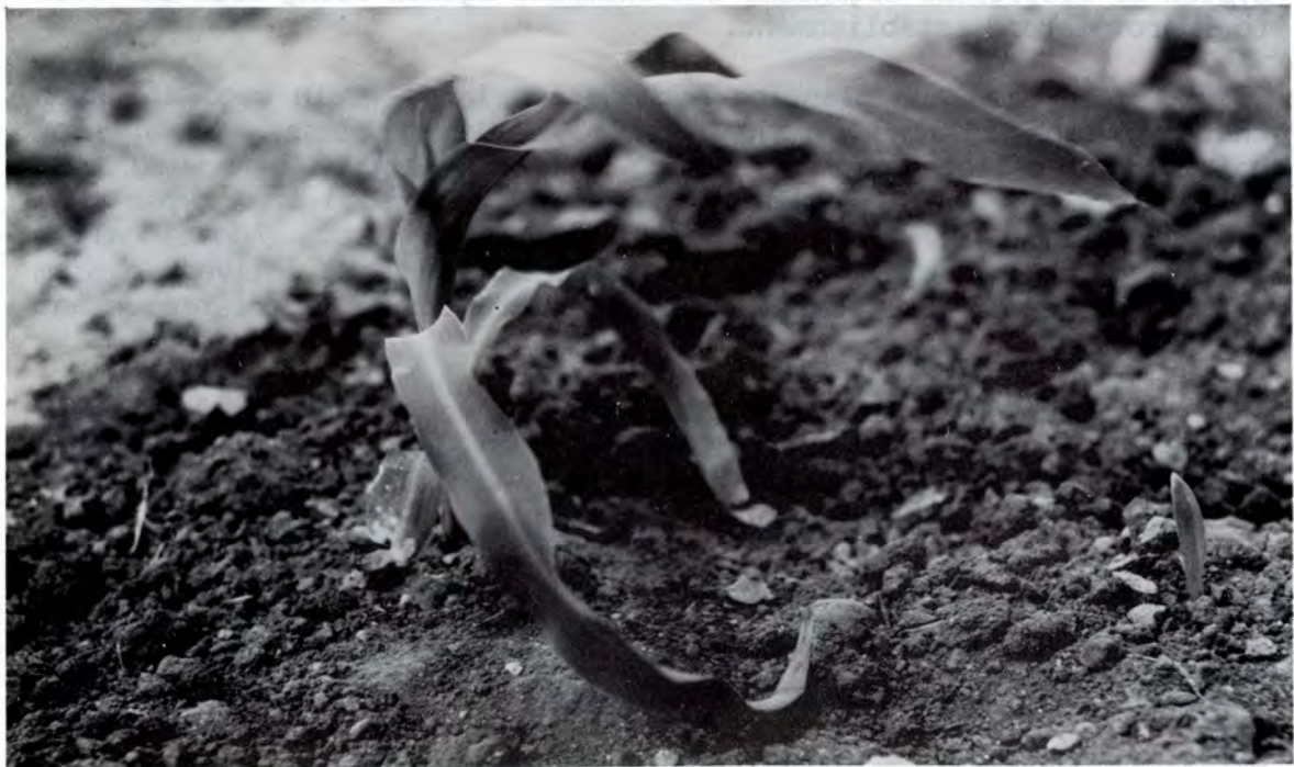
Differential seedling growth of maize resulting from coating (R) and not coating (L) seed before planting.